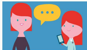
Sign up to our Icebreaker emails